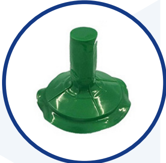
Light Handle Cover