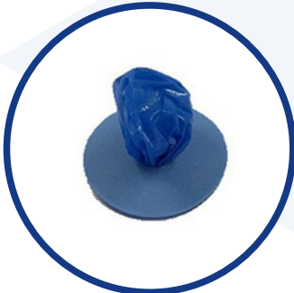
Universal Light Handle Cover - Single