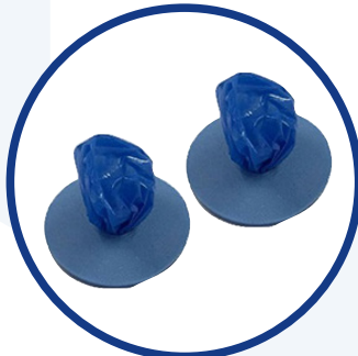
Universal Light Handle Cover - Doubles